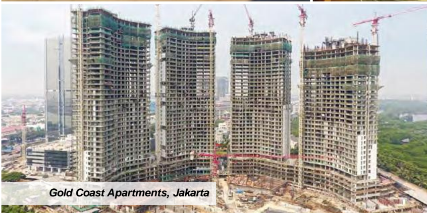
Gold Coast Apartments, Jakarta