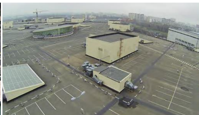
▲ Shopping centre rooftops