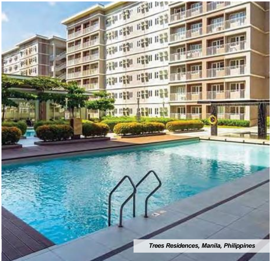
Trees Residences, Manila, Philippines