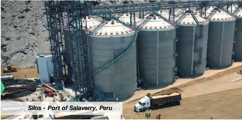
Silos - Port of Salaverry, Peru