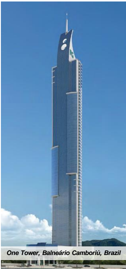
One Tower, Balneário Camboriú, Brazil