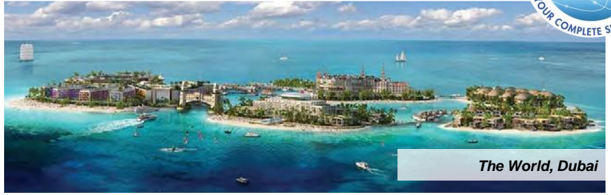
The World, Dubai

Below are just a few of the major projects CWS has completed in Asia-Pacific, Europe, the Middle East and the Americas.