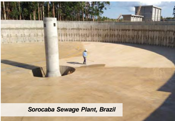
Sorocaba Sewage Plant, Brazil