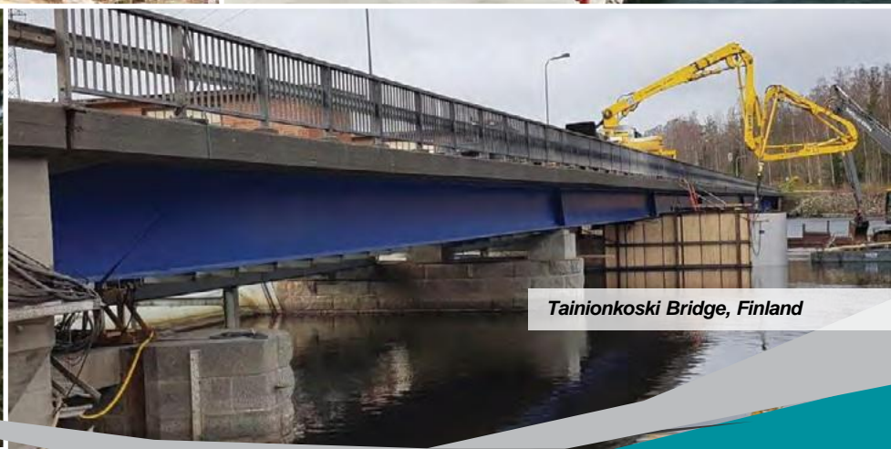
Tainionkoski Bridge, Finland