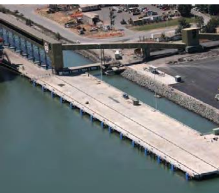
▲ Wharf & marine structures

Because of its ability to withstand thermal stress and its super-fast application, CWS100® is particularly suitable for areas of exposed concrete such as above-ground applications and water tanks.