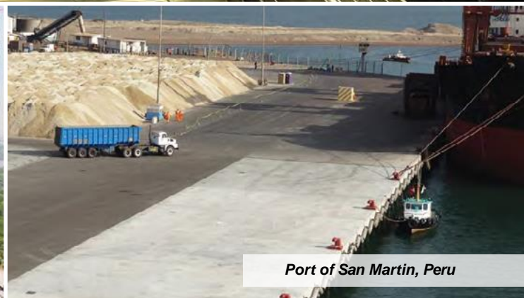
Port of San Martin, Peru