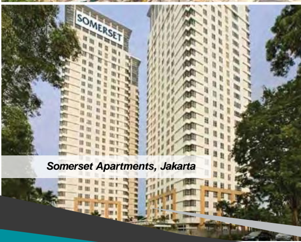
Somerset Apartments, Jakarta