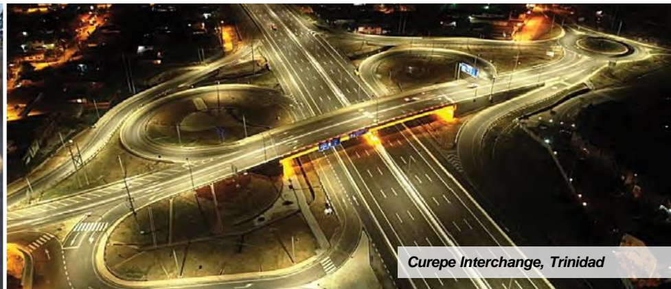
Curepe Interchange, Trinidad