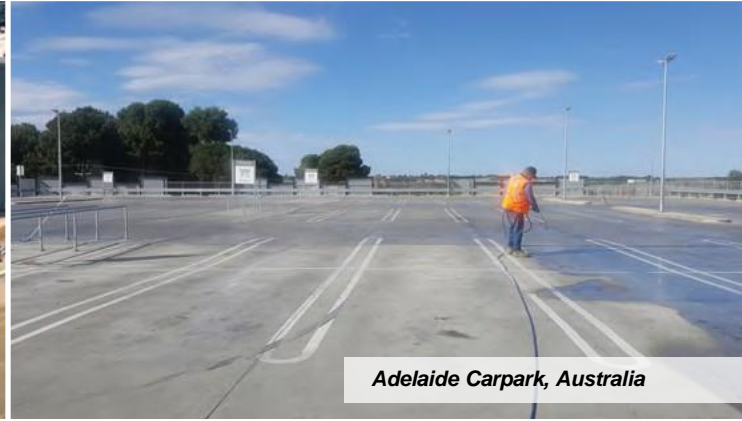
Adelaide Carpark, Australia