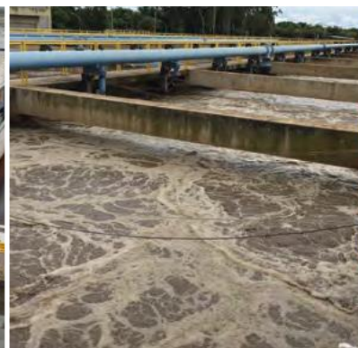
▲ Wastewater plants