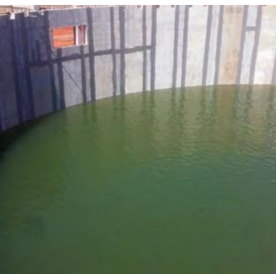
▲ Water tanks